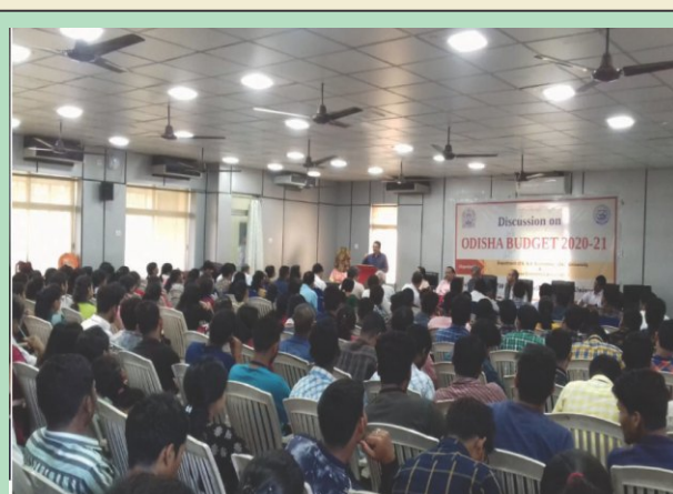
Participants at the Budget Discussion held at the PG Council Hall, Utkal University, Bhubaneswar